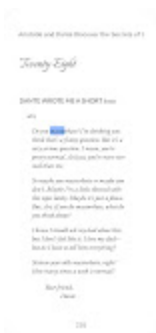
A - EXCERPT - IMG-8463.JPEG 287K